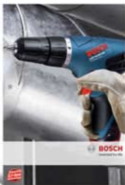
New! Cordless Drill/Screwdriver GSR 10.8 V LIQ Professional

Robert Bosch gave the company his vision and created values that still apply today. He believed that success was based on the trust of business partners and product quality. His mottos were "Selling the best of the best" and "I rather lose money than trust"