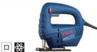
GST 65/GST 65 E