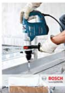
New! Rotary Hammer GBH 4-32 DFR Professional