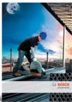
14" Cut Off Machine GCO 2000 Professional