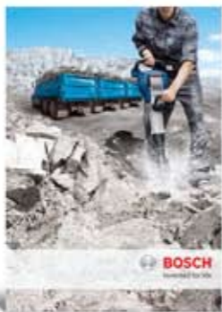
The Demolition Hammer GSH 16 Professional