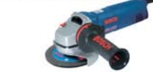
GWS 11-125 CI/GWS 11-125 CIH