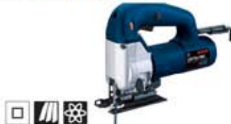
GST 80 PB/GST 80 PBE