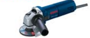
GWS 8-100 C/GWS 8-100 CE